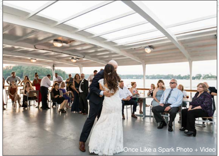
Once Like a Spark Photo + Video

Home Port: Baltimore Finger Piers, Inner Harbor Alternate dockage available with applicable delivery charges.